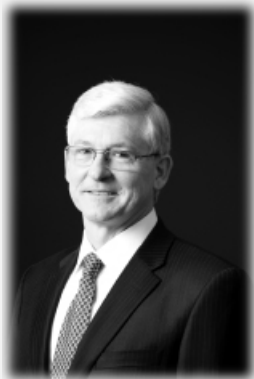
Director since 1992