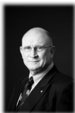
Founder, Chairman and Director since 1989

The following biographical information is furnished with regard to our directors (including nominees) as of June 30, 2012.