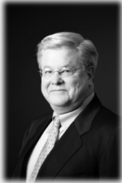
Director since 2005