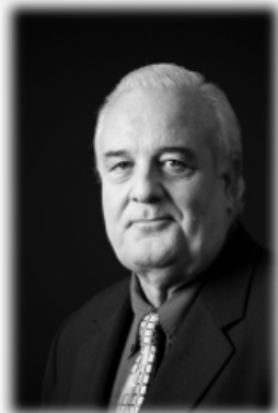
Director since 2005