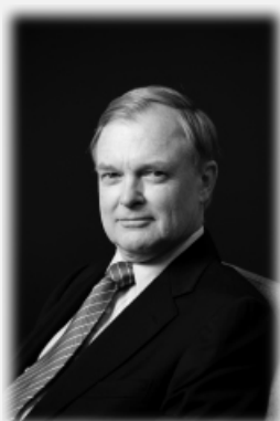
Director since 1992 Chairman, Audit Committee

Directors continuing in office until our 2013 annual meeting