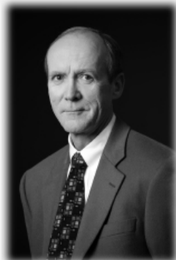
Director since 2005 Chairman, Compensation Committee