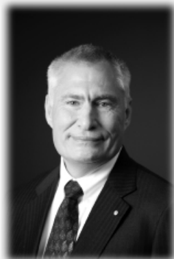
Director since 1994 Lead Director Chairman, Nominating and Governance Committee